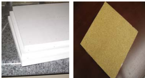
Figure 2 Calcium silicate(left) and particleboard(right)