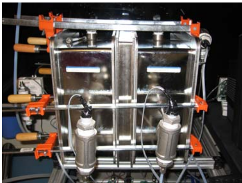
Figure 1 Photograph of the dual chamber system

A dual-chamber experimental method is developed to determine the similarity relationship between moisture transport and volatile organic compound (VOC) transport through porous media. By establishing the similarity relationship, VOC transport properties (diffusion coefficient) can be determined from already widely available moisture properties, and be incorporated in research and design tools for combined heat, air, moisture and pollutant simulation (CHAMPS) in buildings. To better understand the similarity and difference between VOC and moisture transport, a calcium silicate that has already been well characterized for moisture transport is selected as the reference material. Tests are conducted for water vapor, formaldehyde, toluene individually under constant temperature conditions. Future tests will include the effects of humidity on VOC transport, and be extended to materials with significant VOC emissions and transport used in building wall, floor and furniture assemblies.